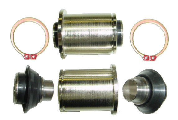
Rear Monoball Kit with weather seals

2 Monoball cartridge2 Beveled retaining ring